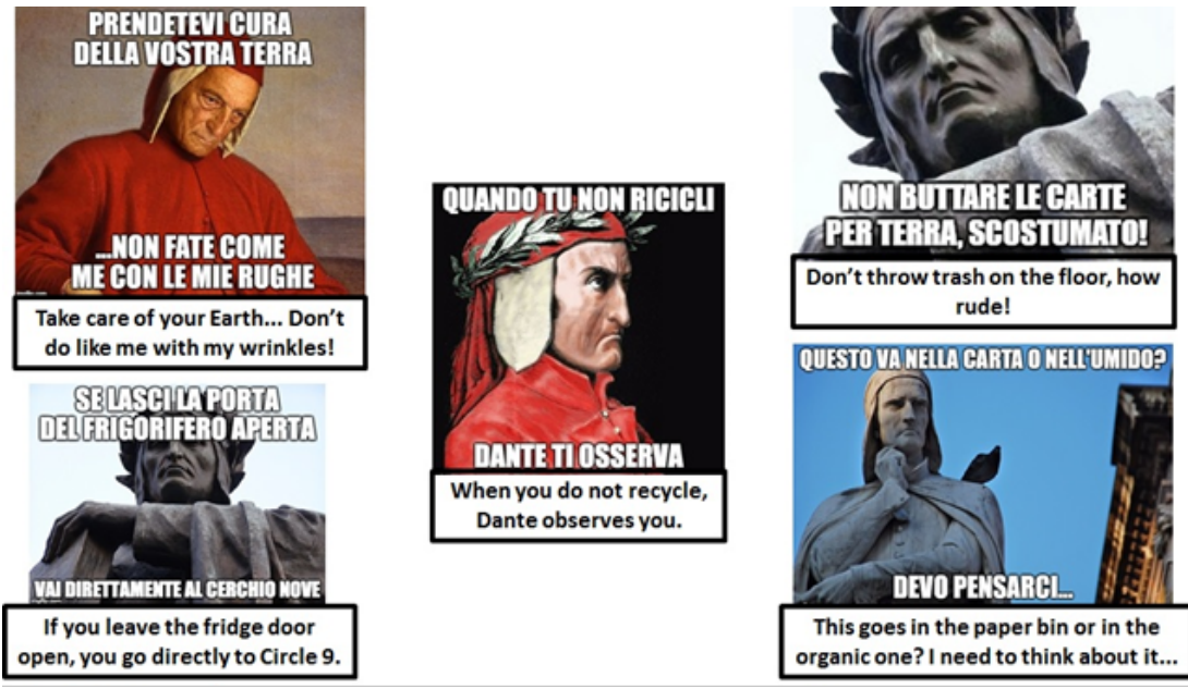
Figure 5. Samples of Dantesque memes created by the students